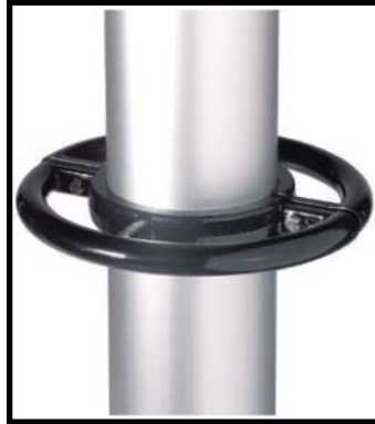
Manual Rotation Wheel