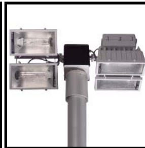
Standard Dual TT