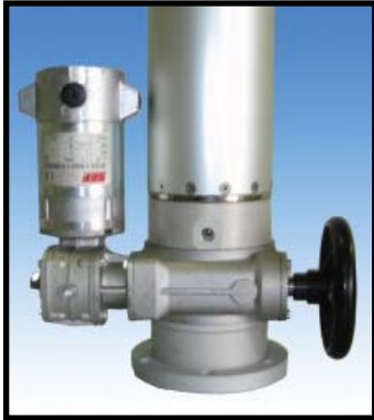
Electric Rotation Unit