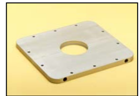
Tower Mounting Brackets